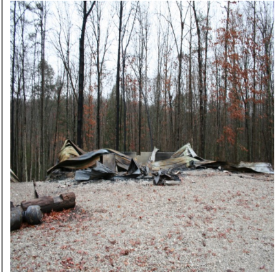
Fire December 2008

Please make your home as fire safe as possible.