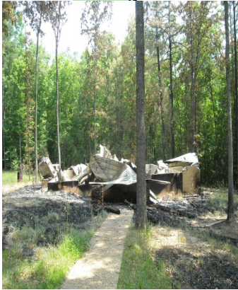
Fire May 2011

On Monday May 30, a cabin on Lonesome Pine burned to the ground. The probable cause of the fire is thought to be electric. Although the police/ fire department response was less than 20 minutes, the cabin could not be saved. They were able to protect the barn and contain the fire from spreading to other properties.